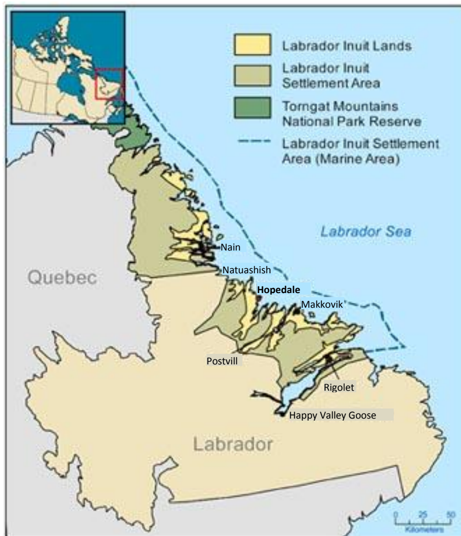
Figure 1: Map of Hopedale, Labrador